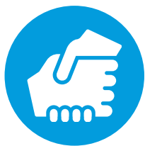
EXHIBIT LOCATIONS: VENTURA, UKIAH, SACRAMENTO, AND ROCKFORD, IL COMMUNITY PARTICIPANTS: 620 COMBINED EVENTS: APATHY EFFECT + FIRST RESPONDER TRAININGS INTEGRATION FOCUS: BRIDGING ADVOCACY AND PROFESSIONAL EDUCATION